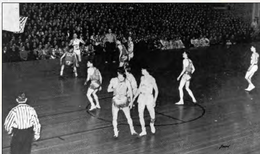
Balch Fieldhouse was the home floor for the Buffaloes during the 1937-38 season.